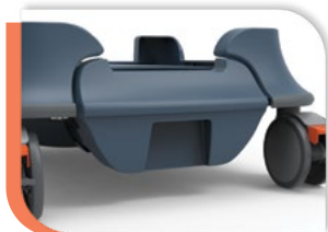
TabloCart with Storage Drawer

TabloCart is an optional accessory that helps you easily get anywhere. And the prefiltration option is designed to help remove sediment and minerals from supply water before it enters Tablo.