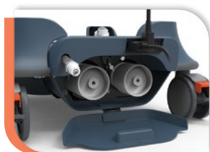
TabloCart with Prefiltration